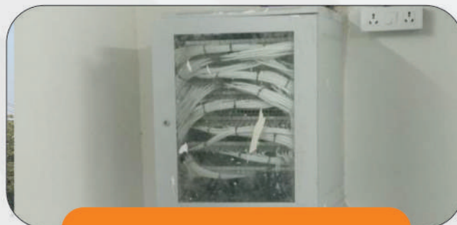
Network rack & cabling work