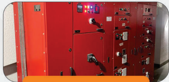
Fire Pump Room Panel